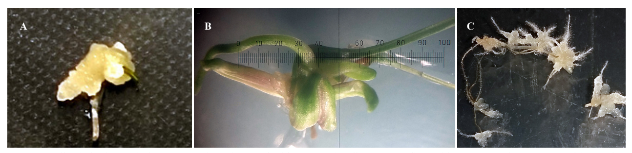
Figure 1. Callus induction and plant regeneration of Kentucky bluegrass: A) callus on a medium with 2,4-D; B) plant regenerated in a culture medium with 0.5 mg/L 2,4-D; C) callus on a medium with 2-3 mg/L NAA.

Means followed by the same letters are not significantly different from each other (p<0.01) as determined by Duncan's Multiple Range Test (DMRT)