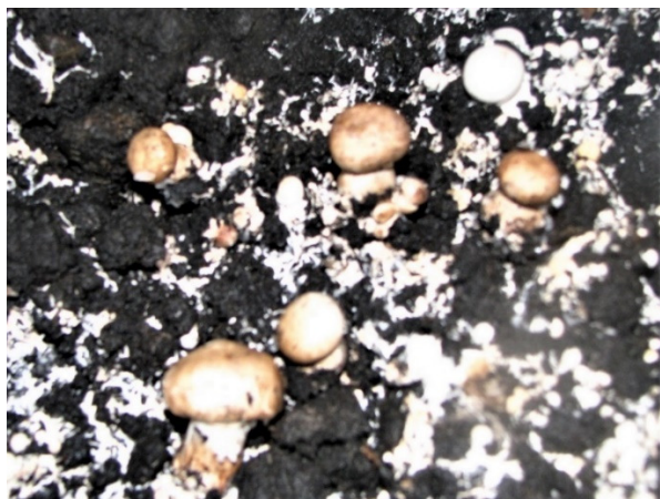
Figure 3. Changes in color and degradation of tissues on mushrooms of A. bisporus

In figure 1 deep brown lesions on the A. bisporus peduncles induced by Pseudomonas fluorescens can be seen.