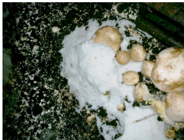
Figure 1. The presence of brown spots on the fruiting bodies of the A. bisporus mushroom

Our monitoring of bacterial diseases on mushroom farms and fresh produce markets in Ukraine revealed the presence of brown spot symptoms [16, 26]. We noted different degrees of the brown coloring of A. bisporus fruiting bodies (Figures 1, 2).