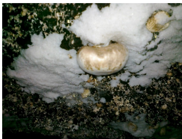
Figure 2. Brown mushroom fruit bodies of A. bisporus

In so far as the research after extraction, more than one hundred bacterial isolates were obtained from symptomatic samples, thirty-seven fluorescent, Gram-negative isolates from different sources and locations were selected for pathogenicity tests. Bacterial isolates showed different degrees of color change and tissue